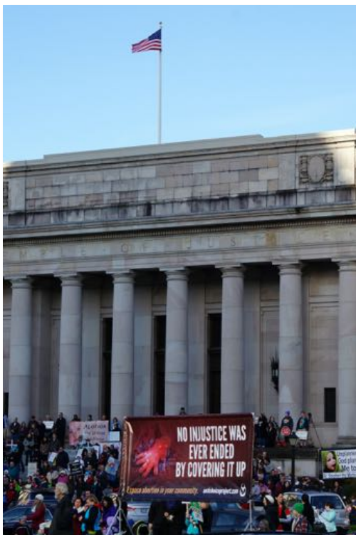
Left: One of two 5'x10' ACP banners at the March for Life in Olympia, Washington, Jan 20, 2015 which reads: "No injustice was ever ended by covering it up."

In keeping with our annual tradition, ACP was present again this year at the March for Life in Olympia, Washington, on January 20 th . An estimated 5,000-7,000 pro-lifers gathered on the steps of Washington State's legislative building to exercise their first amendment rights and give voice to the smallest and weakest members of our society. We stood in protest of the dreadful Supreme Court decisions of 1973 which found in our Constitution a mother's right to kill her preborn children for any reason through all nine months of pregnancy. In Olympia, the Anti-Choice Project displayed our two 5'x10' banners, oriented toward the crowd, affirming the need and challenging others to expose the injustice of abortion.