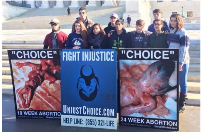
Volunteers of our newest chapter in Washington, DC, participating at the annual March for Life, and showing the reality of abortion outside the Supreme Court, on the 42 nd anniversary of the dreadful Roe vs. Wade decision - January 22, 2015.

"Difficult change is usually unattainable unless the pain of the status quo can be made more intense than the pain of reform. The pro-life movement has been unwilling to inflict pain on the public because doing so invites persecution. Our comfort and safety is being purchased at a truly horrifying price."