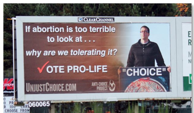
Our billboard reminding tens of thousands of commuters in Kitsap County, WA to Vote Pro-Life in the election.

In our four years of protesting, we have received countless comments from people upset about our pictures but not upset about abortion. Well now, during their commute, they will get to ponder the question: “If abortion is too terrible to look at, why are we tolerating it? ” as we have purchased one of the largest billboards in the area to run this message (pictured right) for four weeks, beginning October 22, 2012.