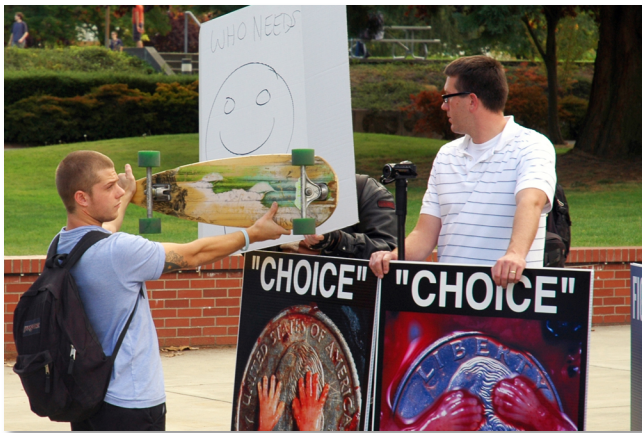
Olympic College students block our security cameras during our first on-campus protest on September 26, 2012.

Another year of our abortion protests is coming to a close. Those of you who have “liked” our Facebook page have probably seen the hundreds of photos from all our 2012 protests. Here are a few highlights and updates from the last three months: