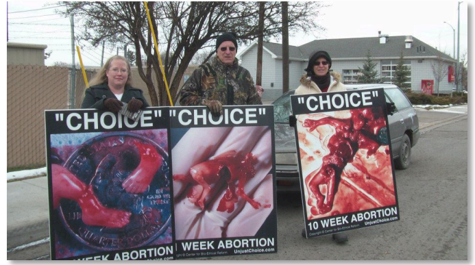
Volunteers for our ACP Missoula chapter expose abortion in the frigid cold outside a local abortion clinic in early February.

Consider the controversy and effort made decades ago by the media to change public opinion in this country about the right of blacks to vote and to drink from the same water fountains as whites. Consider the intensity of the turmoil stirred up by the publishing of disturbing war images, a prerequisite to ending the Vietnam War. Friends, we are fighting a culture war of far greater magnitude, and yet without the aid of the press.