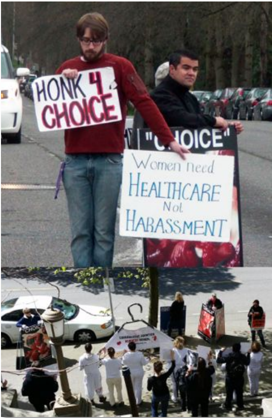
Top: "Seattle Clinic Defense" member tries to cover our signs. Bottom: "Stop Patriarchy" holds large foam coat hanger while ACP stands opposite.

Speaking of pro-abortion rallies, ACP Bremerton and ACP Seattle teamed up on Saturday, March 15 th , to counter a pro-abortion rally outside the Northgate Planned Parenthood and organized by a group called "Seattle Clinic Defense", and again on April 12 th to counter a pro-abortion rally by the group "Stop Patriarchy" outside St. James Cathedral in downtown Seattle. As you might imagine, neither group was pleased to endure the sight of abortion victims for the duration of their pro-abortion rallies. Meanwhile, their worn out, free-hand drawn cloth banner slogans and their shabby, foam clothes hanger prop were displayed in stark contrast to our professionally photographed and printed abortion signs – which put what they were rallying for into context.